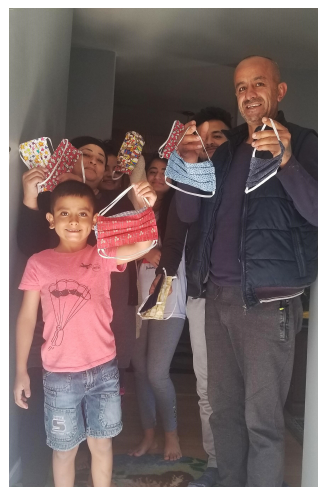
Volunteers with MCC Manitoba sewed handmade masks for newcomer families who were sponsored by church and community groups through MCC. They were distributed by staff at a safe distance last spring.